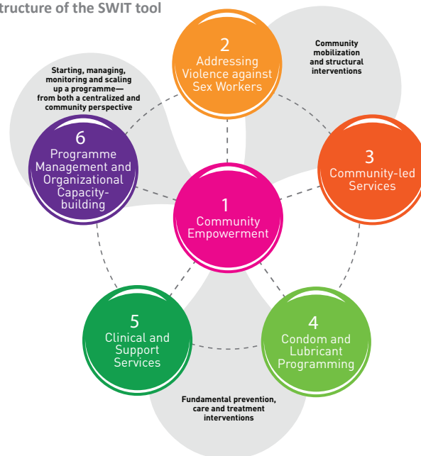
Source: Implementing comprehensive HIV/STI programmes with sex workers: practical approaches from collaborative interventions . http://www.who.int/hiv/pub/sti/sex_worker_implementation/en/