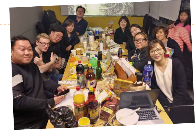
UPR party in Seoul by Rainbow Action South Korea – 28th UPR Working Group sessions

2 days after the review (or before, if specifically requested), ILGA's UPR Summary will be available. This summary contains all the SOGIESC information of the Working Group Session for each country: from the national report, stakeholder's summary, UN summary, advanced questions, recommendations made, remarks of the State under Review and a comparison with the State's previous UPR review.