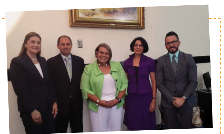
Follow-up and implementation meeting in San Jose, Costa Rica with the Ministry of Foreign Affairs and the CSO MULABI.

If possible, meet with your State – perhaps with other CSOs – to encourage them to implement their recommendations. Share with them your strategies for doing so. Urge them to conduct ongoing consultations and to maintain a close working relationship with your organisation and wider civil society throughout the whole implementation phase, not just at the start. Remind your government that you are still committed to recommendations that they may have noted.